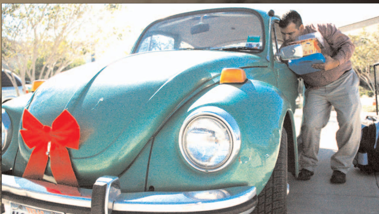
Bobby Bush | FOGHORN